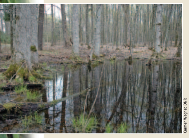
Small wetlands can be easily avoided by rerouting roads and trails.