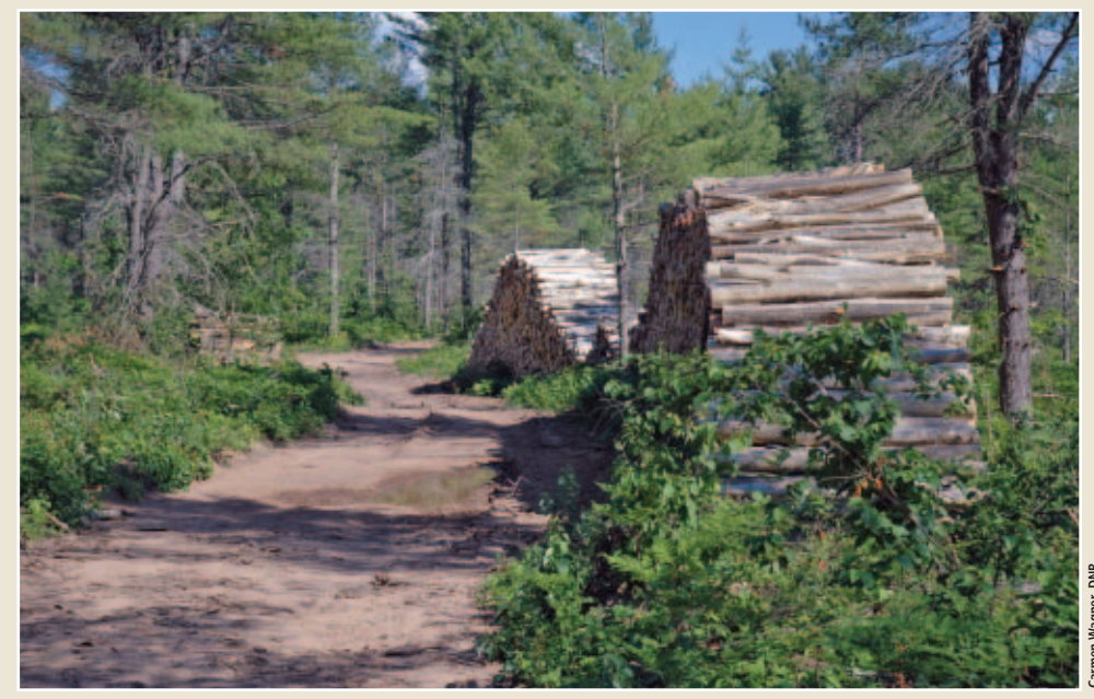
Roads and landings in upland areas tend to be easier and cheaper to construct than in wetlands.

As a result, the construction and maintenance of roads and trails that cross lakes, streams