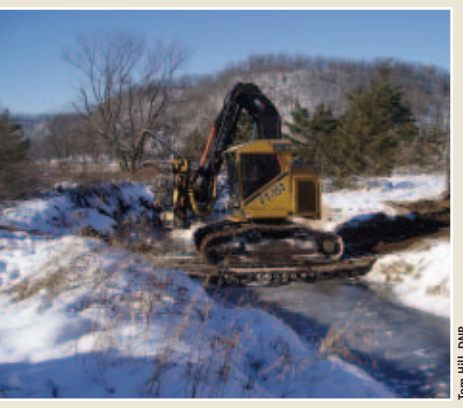
Temporary crossings, like timber mats and pole fords, provide excellent access when permanent crossings are not required.

where the channel is straight and narrow, the banks are low and the soil is firm and rocky. The approaches to the crossing should be as low or flat as possible. Crossings with large wetlands adjacent to the stream should be avoided, if possible. If a large wetland is next to the stream, a temporary stream and wetland crossing may be the best solution.