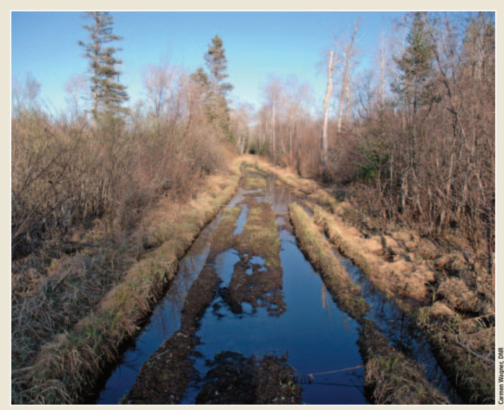
Poorly located and maintained roads can affect water quality and wildlife, as well as be impassable for long periods of time.

If any stream crossings are required, you should identify the best locations for the crossing first and then bring the road to that location. Stream crossings are ideally placed