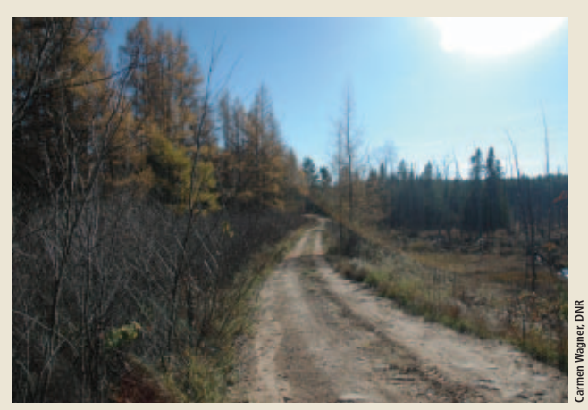
This road failed to provide adequate cross drainage for water flow through the wetland. Trees on the "uphill" side of the road drowned out as a result.