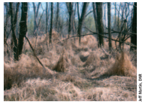
Reed canary grass

Unfortunately, roads and trails can also present some management challenges. Both foot and motorized traffic have been shown to introduce invasive species, like garlic mustard and reed canary grass. Roads and trails may have unintended consequences on wildlife by disrupting their favored travel corridors. Roads and trails can also have impacts on water quality in lakes, streams and wetlands.