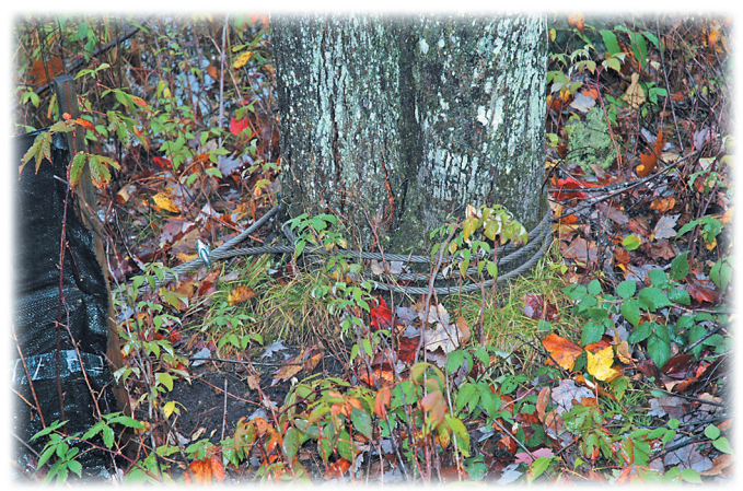
Temporary bridges should be anchored to a tree or similar object to prevent the bridge from washing downstream during floods.