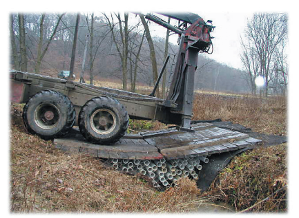
To help stabilize pole fords, wood panels can be placed over the poles. With the wood panels in place, this pole ford can support a processor.