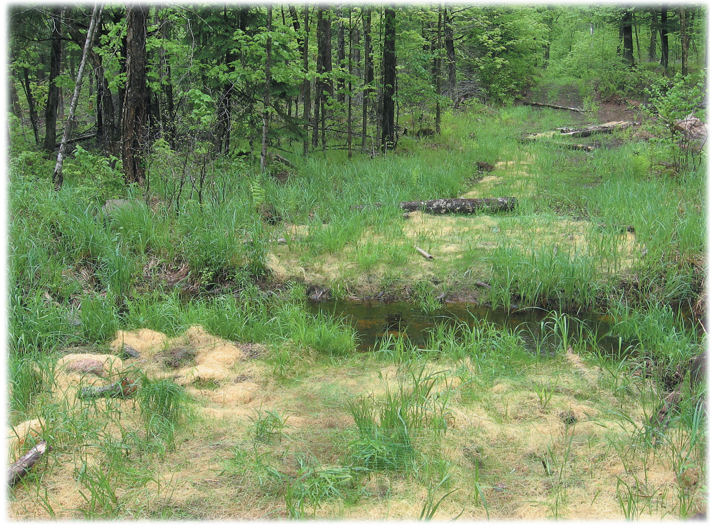
Permits require the streambanks to be stabilized when the crossing is removed. At this crossing, excelsior erosion control mats were used to hold the seed mix and soil in place.