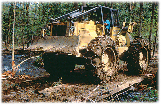
Temporary skidder bridges, such as this one, can be installed without soil backfill or modifications to the stream banks.

These effects may be minimized with the use of properly designed and installed temporary stream crossings. Temporary stream crossings can be installed without soil backfill or modifications to stream banks, reducing any effects on water quality and wildlife habitat. Following removal of the temporary stream crossings, stream banks are revegetated, if needed, to prevent erosion. Compared to permanent stream crossings, temporary stream crossings are generally preferred, if feasible, in order to limit the duration and magnitude of potential effects to a stream.