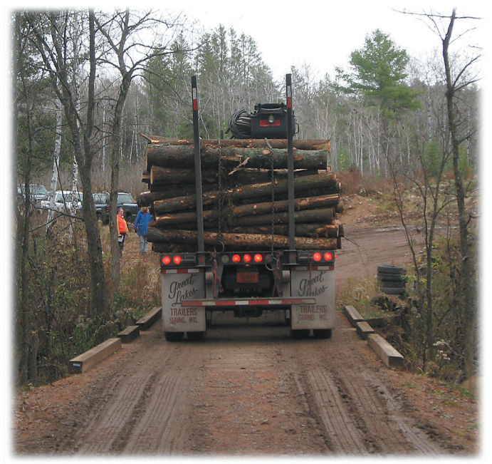
This timber bridge can support fully loaded logging trucks.

Temporary stream crossing structures fall into three general categories – portable bridges, timber mats and pole fords. Each has its advantages and disadvantages, depending on your situation. Information on structural characteristics and engineering specifications can be found in the resources listed later in this document. A licensed engineer can also help to design a safe stream crossing structure that fits your needs.